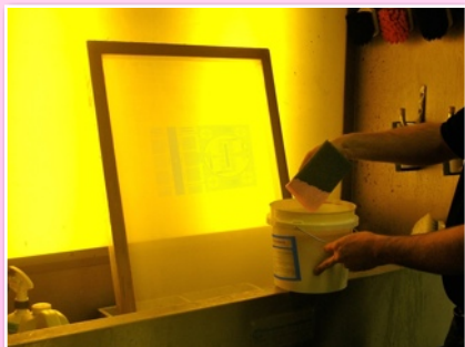
Step 1. Apply "The Pink Stuff" to both sides of the screen.