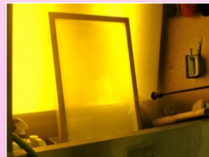
Step 3. High pressure rinse - starting at bottom.